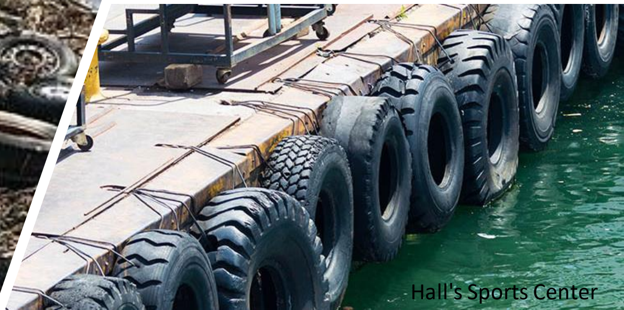
Hall's Sports Center