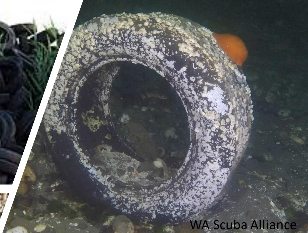
WA Scuba Alliance